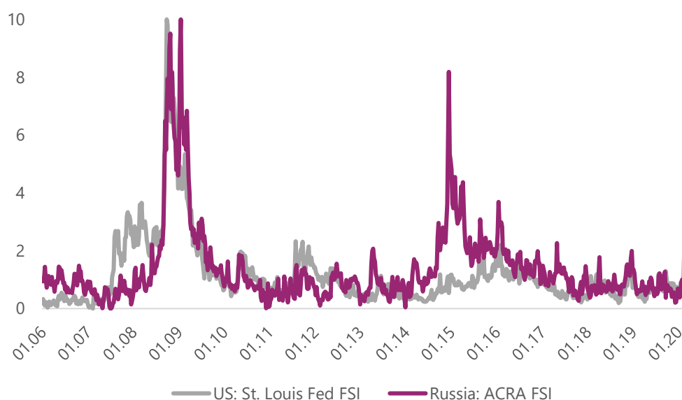
Figure 1. Dynamics of financial stress indices 1 for Russia and the United States